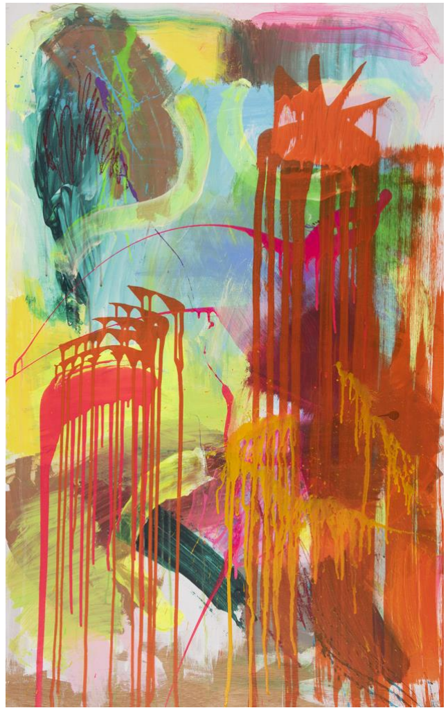
Lily Pond , Acrylic and oil pastel on wood panel, 48 × 30", 2022

Jared's significant accomplishments include exhibiting in Tokyo and at the National Gallery of Costa Rica, giving an artist talk at the Art Gallery of Nova Scotia, and exhibiting in two group shows at the Beaverbrook Art Gallery. Based in Moncton, New Brunswick, he is the recipient of eleven ArtsNB grants, as well as numerous Tourism, Culture and Heritage grants from Nova Scotia and New Brunswick.