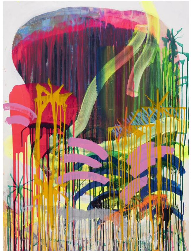
Seeing Through , Sparkles, acrylic paint, oil pastel and urethane on wood panel, 40 × 30", 2022

I am very inspired by the abstract expressionist movement in the 40s and 50s. They wanted to create freely, with automatic art, action art and about emotions, rather than something representational.