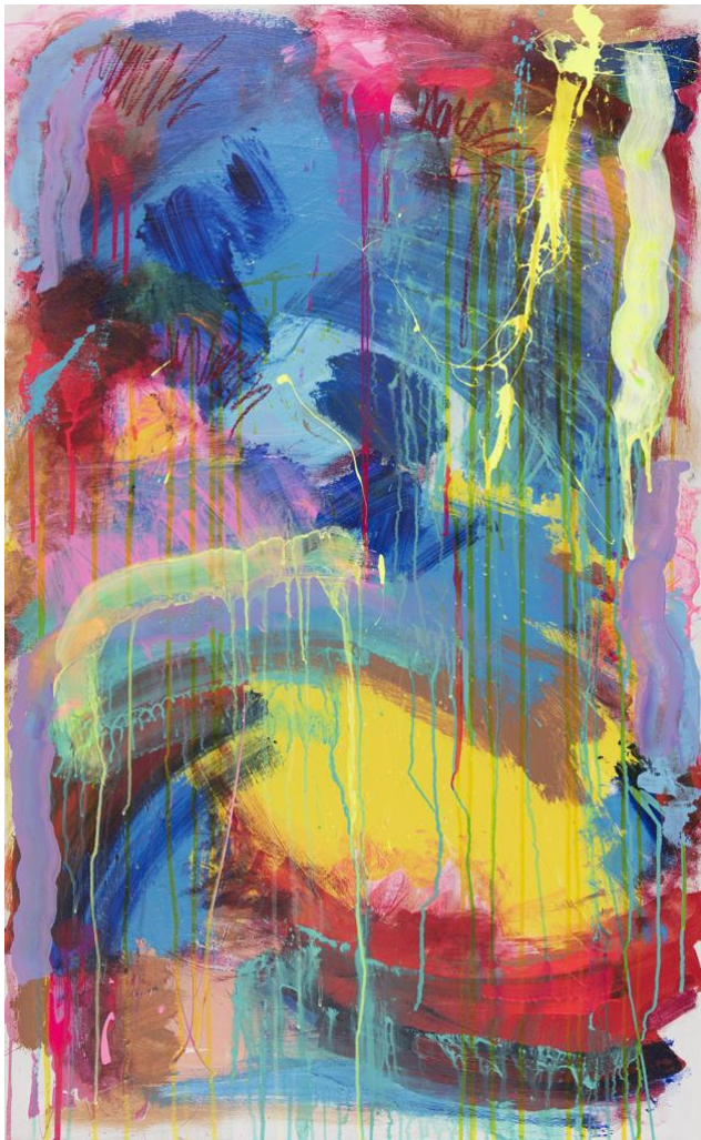
Moon Bathing , Sparkles, acrylic and oil pastel on wood panel, 48 × 30", 2022

Lately, I have been realizing more than ever that we are made of the same things stars are made of, atoms, carbon, energy... the same atoms that are created in the dying stage of an exploding star. Too often, we can be so busy during the day that we can forget just how beautiful and magical we are as humans.