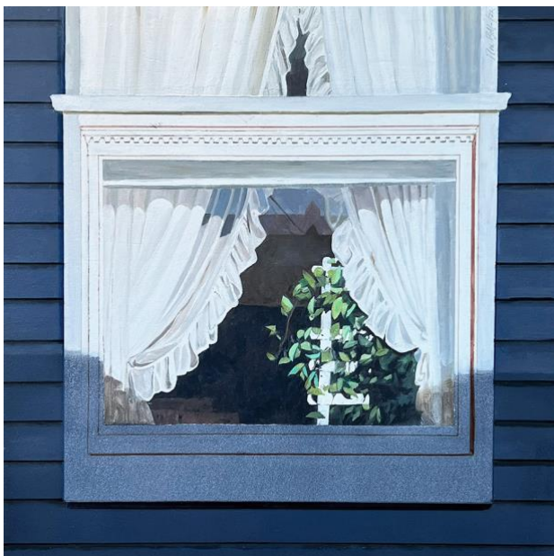
Urban Variations, St. John's #5 , Oil on board, 24 × 24", 2022