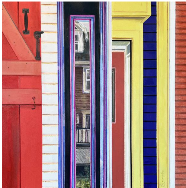
Urban Variations, St. John's #10 , Oil on board, 24 × 24", 2022

Over several months I studied, enlarged and cropped these photographs out of context until they began to suggest relationships with each other. At the same time I was working on large hard-edge colour field paintings. So, whether I realized it or not I had been preparing to begin the Urban Variations ."