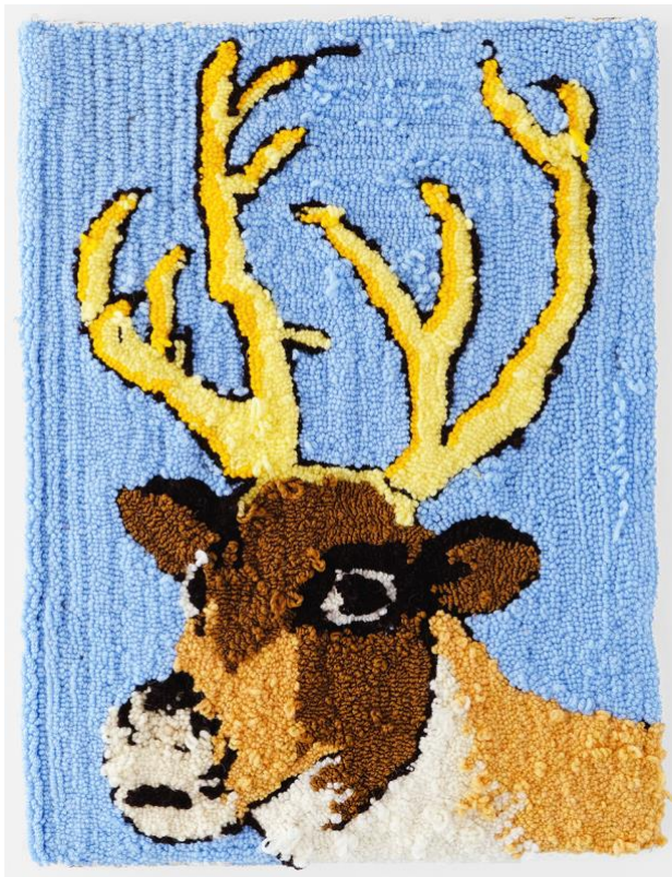
Trophy , Wool, burlap mounted over plywood, 24 × 18", 2023

Rather than a hand-made approach to the production of these rugs and a reliance on natural materials and processes, recent developments in my practice have seen me embrace an industrialized method of working that foregrounds a mechanized power-tool (a tufting gun) as well as non-natural acrylic wool (a petroleum product).