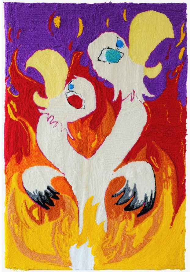
Love Is Colder Than Death , Wool, monkscloth mounted over plywood, 72 × 48", 2023

What appears naïve, quaint, rustic, and romantic in each piece is in actuality the opposite. While what is grotesque, playful, and disturbed are just that. My work occupies a space that is both heartfelt and satirical at once.