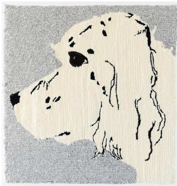
Blue Belton (Duke) , Wool, monkscloth mounted over plywood, 37.5 × 36", 2023