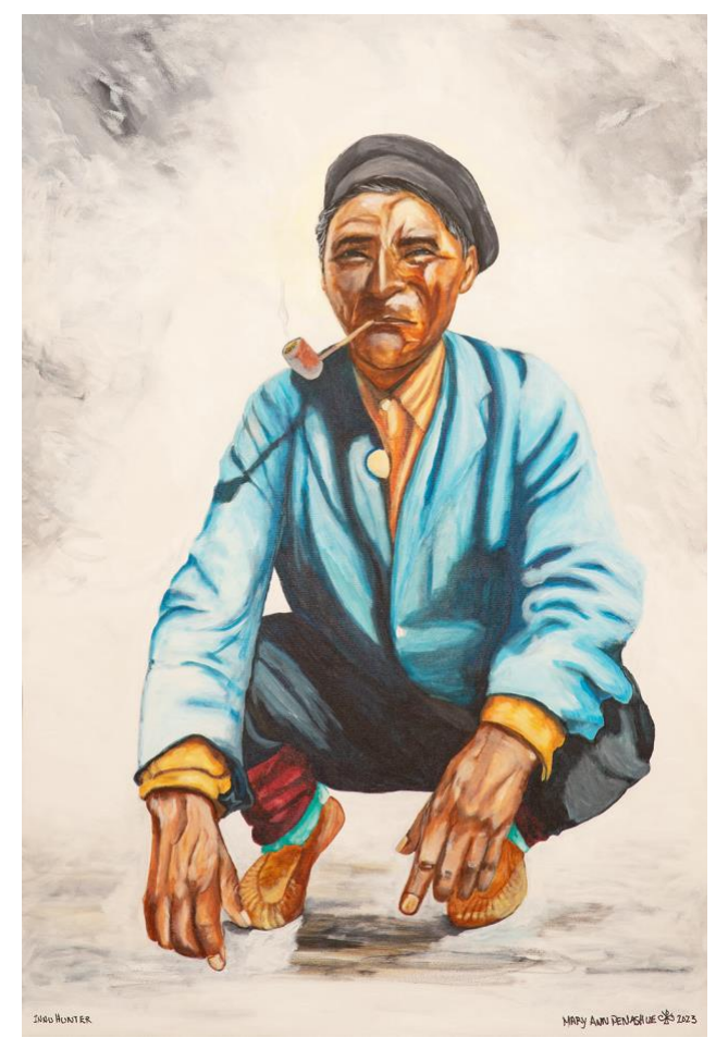
Innu Hunter, Acrylic on canvas, 36 × 24", 2023