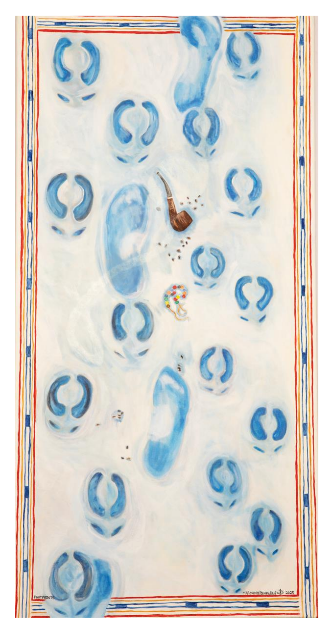
Footprints, Acrylic on canvas, 48 × 24", 2023

Penashue's work calls attention to the resonance between the people and the land, and the land to the people. Each portrait elevates Innu presence, survival and resilience, more than often absent from mainstream society. They are an invitation to celebrate the important history and relations throughout Ninan Nitassinan (our land).