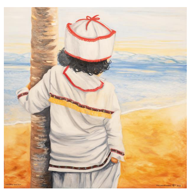
Ceremonial Walk Out, Acrylic on canvas, 36 × 36", 2023

Penashue's suite of new works was created for the 2023 Bonavista Biennale. They are an important contribution, enabling viewers to acknowledge nearby places which they may not have encountered or understand.