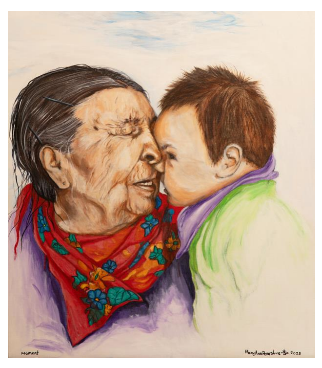
Moment, Acrylic on canvas, 16 × 12", 2023