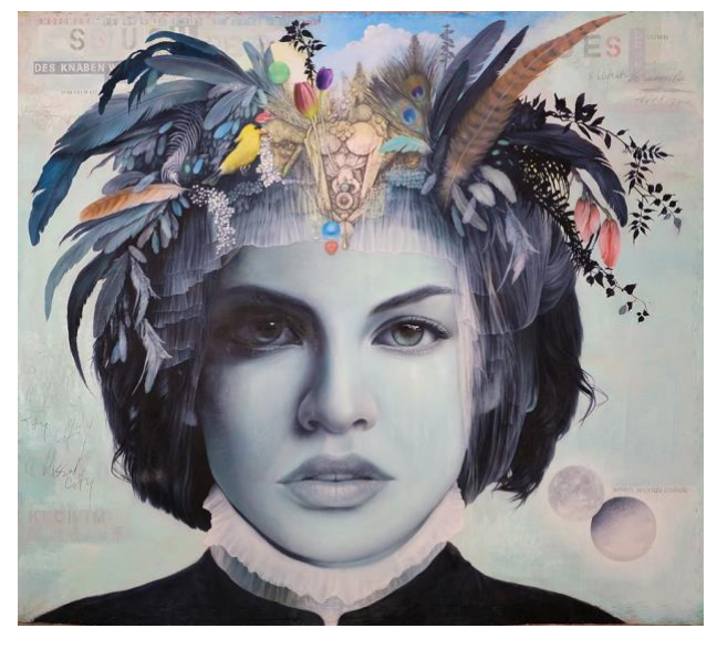
#5 What the Angels Tell Me , Oil, acrylic, latex paint and graphite on prepared canvas with grommets, 83 × 94", 2014–2022