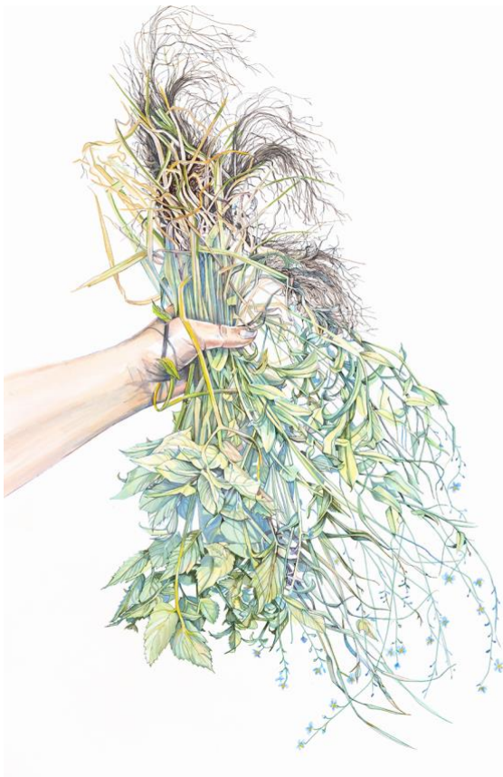
Pulling up the weeds , Mixed media including watercolour, ink, pencil on Fabriano, 28 × 20", 2024

Growing Season is an exploration of my transition to motherhood, a moment of extreme vulnerability but also strength and life-giving power. This period of change has redefined my identity and reshaped my relationship with my community, amplifying my awareness of our societal connections to nature and the land. Navigating this evolution, I have found grounding in my garden. As a gardener and mother, I attempt to hold in balance the desire to nurture and protect without controlling or restricting.