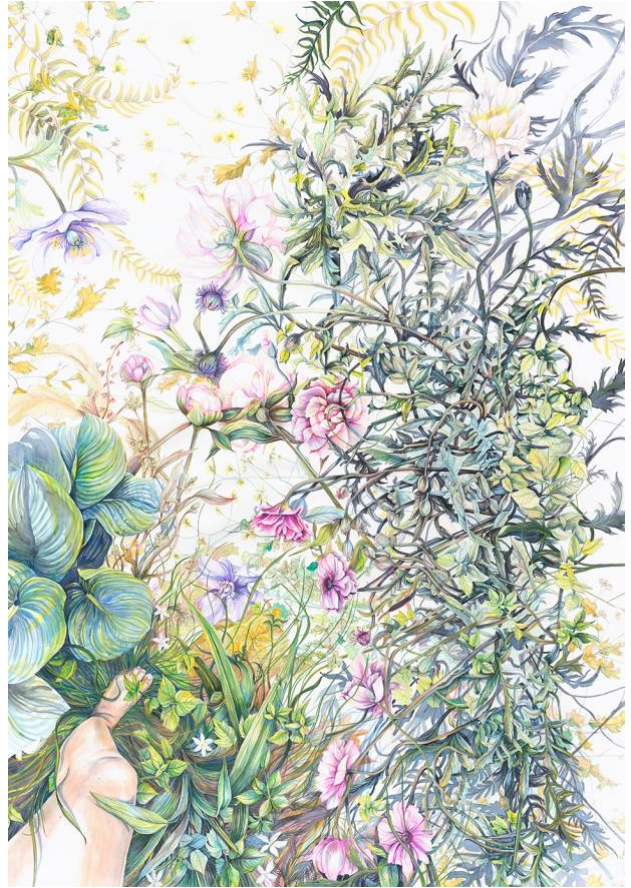
Undertouched , Mixed media including screenprint, watercolour, ink, pencil on linen backed paper, 60 × 39.5", 2024

Each action can be seen as a metaphor for our yearning for harmony with nature in a capitalist culture that often disconnects us from the land and each other.