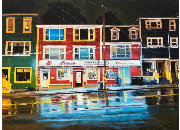
Caines Grocery , Oil on canvas, 30 × 40", 2022

Emilie transforms the reality of intimate and unexpected scenes into a tableaux of detailed forms. By evoking a reflection and immersion of self in the landscape through window scenes and urban street corners, she pictorially slows down the rapid pace of a changing world by giving permanence to a mutable urban environment.