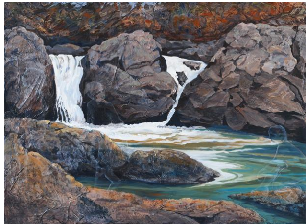
Cascading Water on Waterford Linear Trail , Acrylic on canvas, 36 × 48", 2025

such as the Manuel's River Hibernia Interpretation Centre, the Deer Lake Airport, the Fluvarium, St. John's, Labrador Health Centre, Goose Bay, and Community Hospital in Monterey, California.