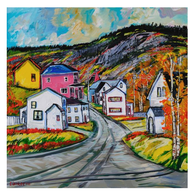
Walk Through Quidi Vidi, Acrylic on canvas, 36 × 36", 2025

When you live in the city and leave to go back around the bay to where you came from, like I did, you miss the old streets and how they bloomed with colour. I can still smell autumn in the tree saps and feel the fall winds blowing silently between the old houses of downtown. It is so nice to take pallet knife and brush and to be able to create a symphony of it all.