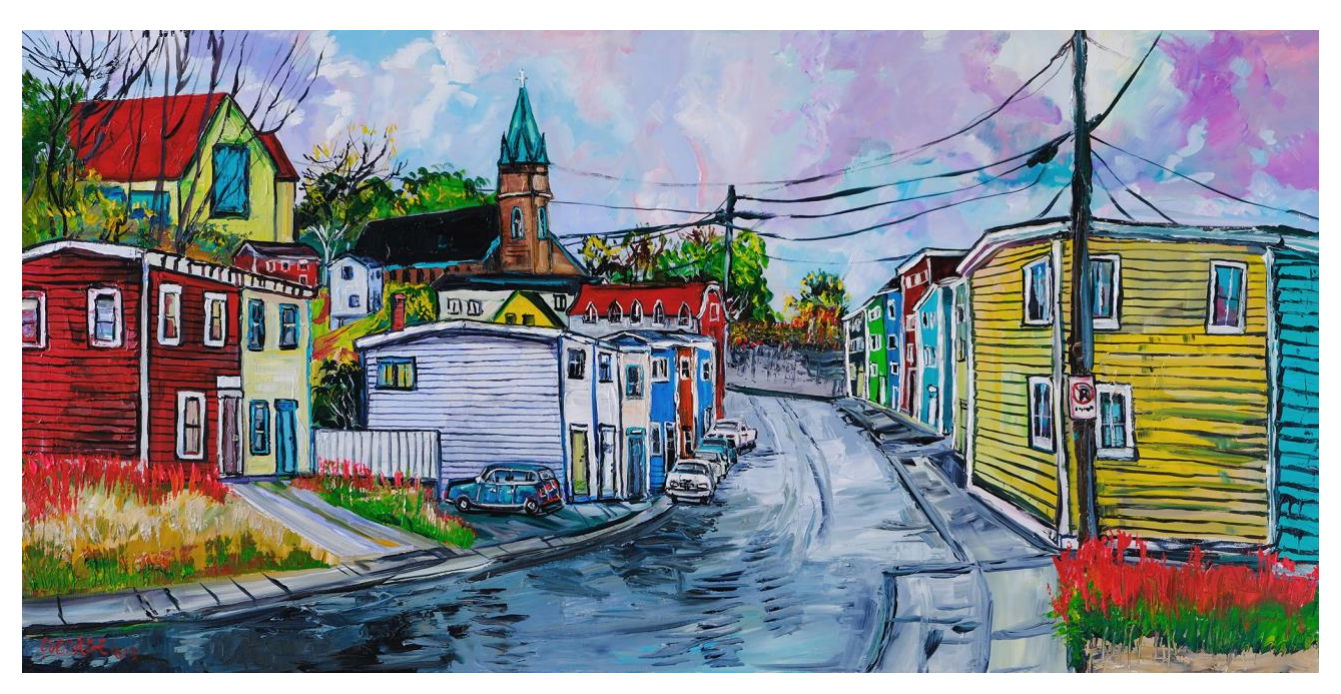
Livingstone Street, Acrylic on canvas, 36 × 72", 2025