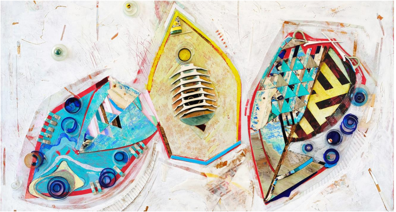
Navigational Confusion (detail) , Cut glass, found objects, acrylic paint, resin on birch panel, 36 × 60", 2022