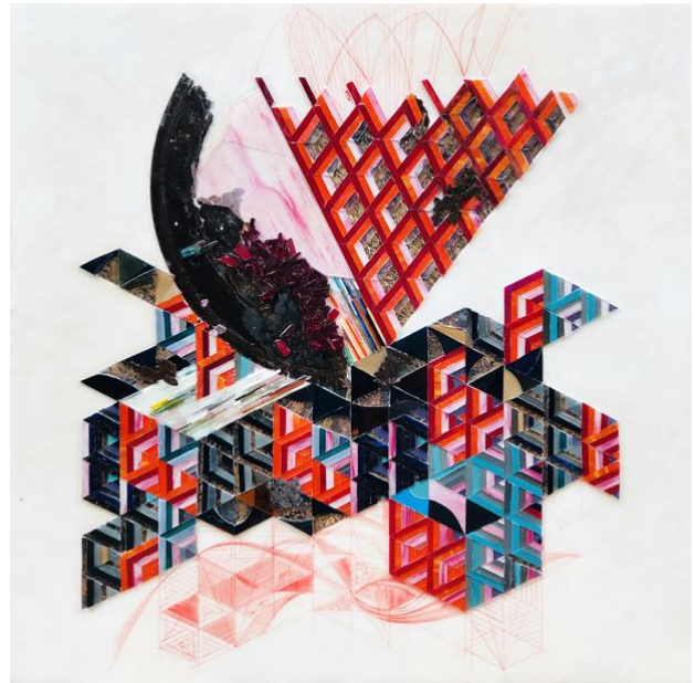
Brake or Break #1 , Cut glass, found objects, dry point on resin on birch panel, 36 x 36", 2020

make art that's a physical record of the inner experience. Chasing the light drives my creative process. Glass is my medium for capturing, embracing, and reflecting that light."