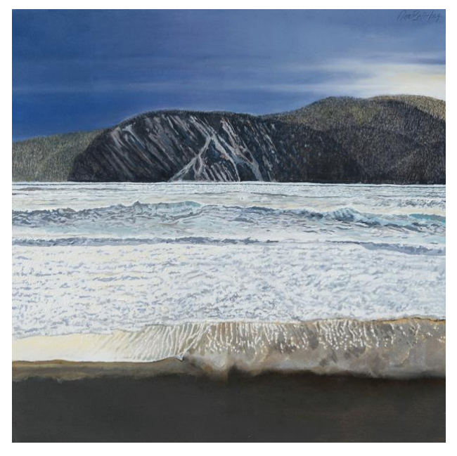
A Cold Morning, Oil on panel, 24 × 24", 2024

regions has taken him to three coasts of Canada, the Carribean and Europe. In 2000 he was awarded the position as Artist in Residence at Gros Morne National Park, Newfoundland, and in 2002 he spent a month as guest artist of the U.S. National Park Service in the Mohave Desert of southern California.