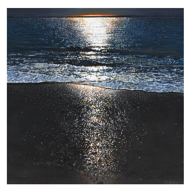
Transcendent Night, Conception Bay, Oil on panel, 24 \times 24 ", 2024

Bolt's work is concerned with the natural environment and fits most completely into what has been described as the "Northern Romantic Tradition." His imagery of the sea and coastal