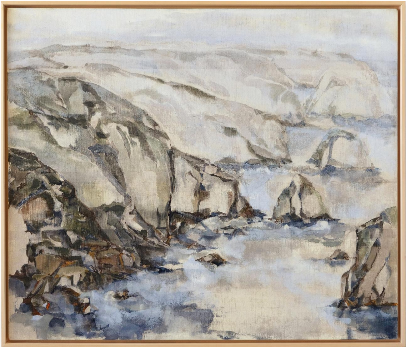
Edge, 3, VERSO , VERSO acrylic, archival ink in reverse then restretched to finish, 32 × 38", 2020