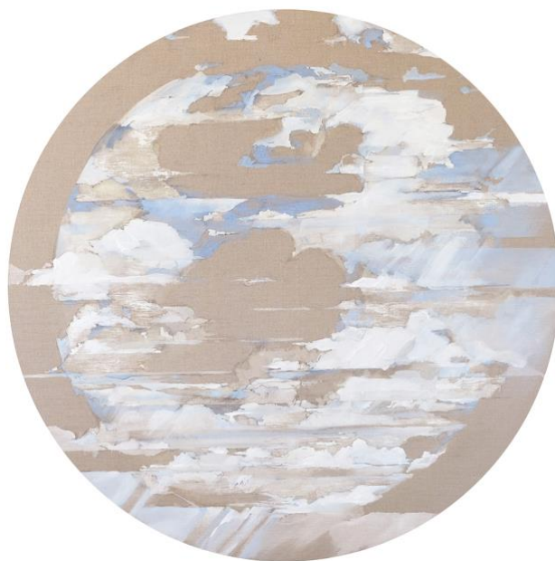
Under the Same Sky , Acrylic, archival ink, Japanese graphite on raw Belgian linen, VERSO, 48" diameter, 2023

Houston's techniques include the use of positive and negative space, the absence of paint, painting in reverse and seaming materials to emphasize the power of the horizon. "Painted colour" of each material is enhanced by engaging the warp and weft of Belgian linen and the grain of wood panels, and by changing the ground colour in the canvas. Through form and scale Houston's work enhances these two and three dimensional expressions of place, imbued with meaning found in the landscape of Newfoundland's history, culture, tradition.