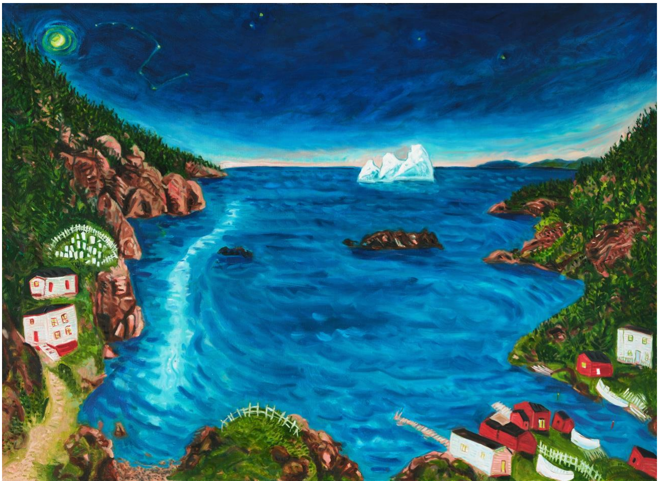
Moonrise Over the Harbour , Oil on canvas, 40 × 60", 2021

ALAN STEIN RCA OSA established a painting studio and The Church Street Press in Parry Sound in 1988. At The Church Street Press Alan hand prints limited edition books illustrated with his own wood engravings. In 2014, Alan established a painting studio in Old Bonaventure, Newfoundland.